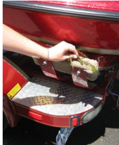
IMAGE: Lake Stewards show boat launch users how to inspect trailers and equipment for invasive plants and animals.

The Lake Stewards program at boat launches continues in 2009 with public outreach at New York and Vermont access areas. Stewards will be present at Shelburne, Burlington, Malletts Bay, and St. Albans VT Department of Fish and Wildlife accesses in Vermont. The NY stewards are stationed at Peru, Wilcox, Point Au Roche, and occasionally Ticonderoga NYS Department of Environmental Conservation launches. They also will attend fishing derbies on the Lake to provide information about aquatic nuisance species. Learn more about this and other invasive species prevention programs by visiting www.lcbp.org/nature.htm or contacting Meg Modley at mmodley@lcbp.org .