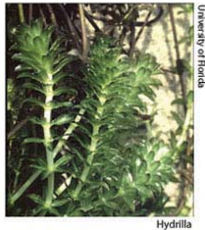
IMAGE: Hydrilla, an aquatic invasive species

This plan will be very helpful should hydrilla (for example) be found in Lake Champlain. Hydrilla has rapidly spread since it was introduced into Florida waters by an aquatic fish dealer--it is now found in Connecticut, Maine, and Massachusetts. The aggressive invasive poses a looming threat to Lake Champlain as it is very adaptable and difficult to control once it has established a population. A Rapid Response plan would limit its impact on the Lake and prevent hydrilla from clogging waterways. For more information about hydrilla or other aquatic nuisance species, visit www.lcbp.org/nature.htm .