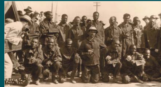
Soon after the battle of Carrizal, Mexico released the captured men of the 10th. This photo is believed to have been taken on the International Bridge at El Paso, Texas.