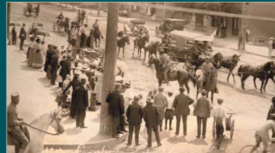
Troopers of the 10th Cavalry on the move through Winooski. Like other troops stationed at the Fort, they were a source of great excitement and interest to local residents.