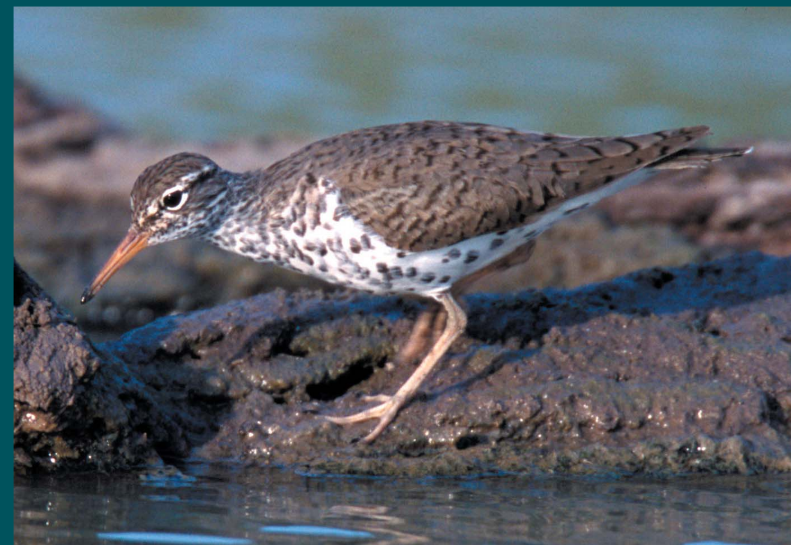
Spotted Sandpiper ( Actitis macularia )