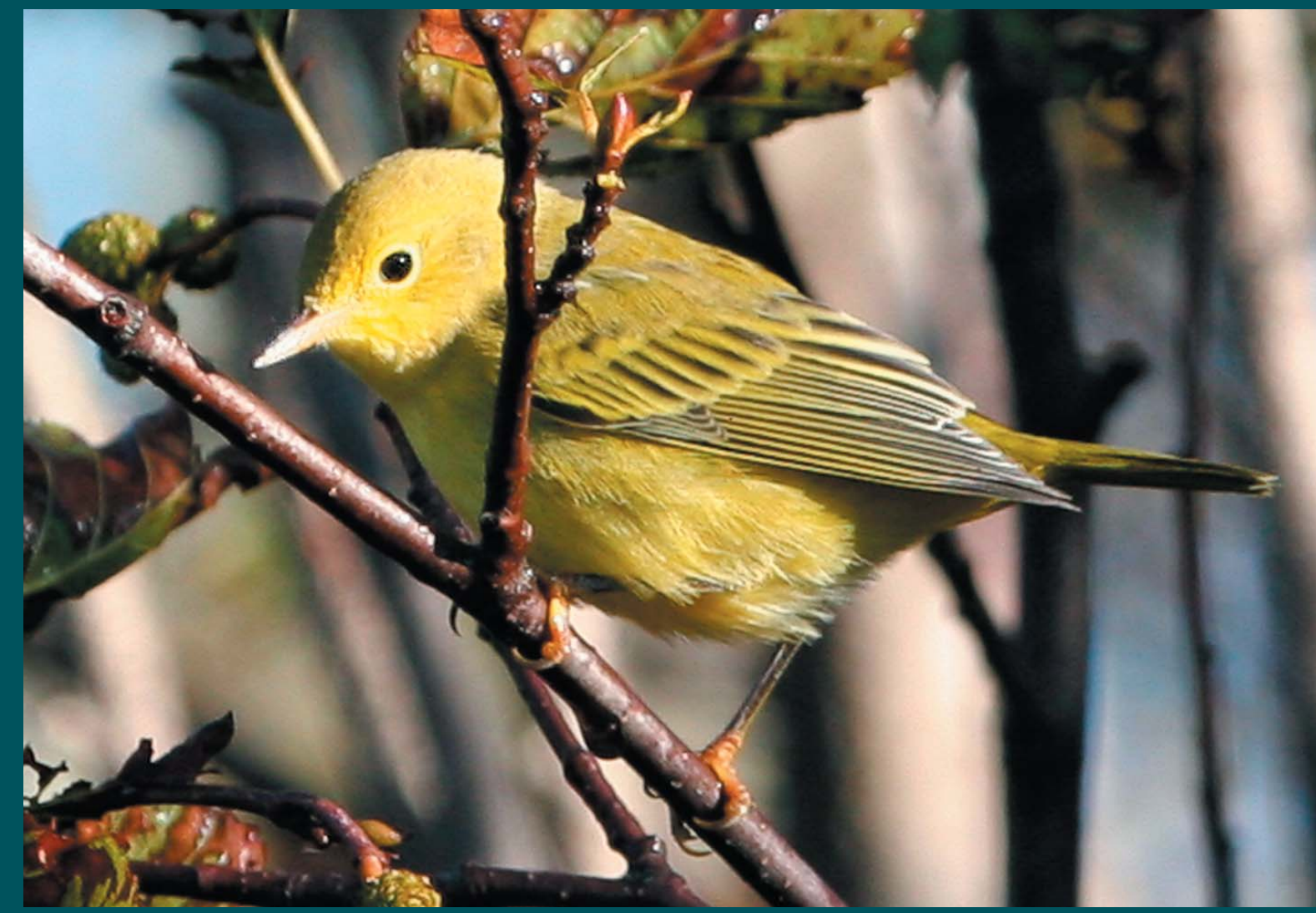
Yellow Warbler ( Dendroica petechia )