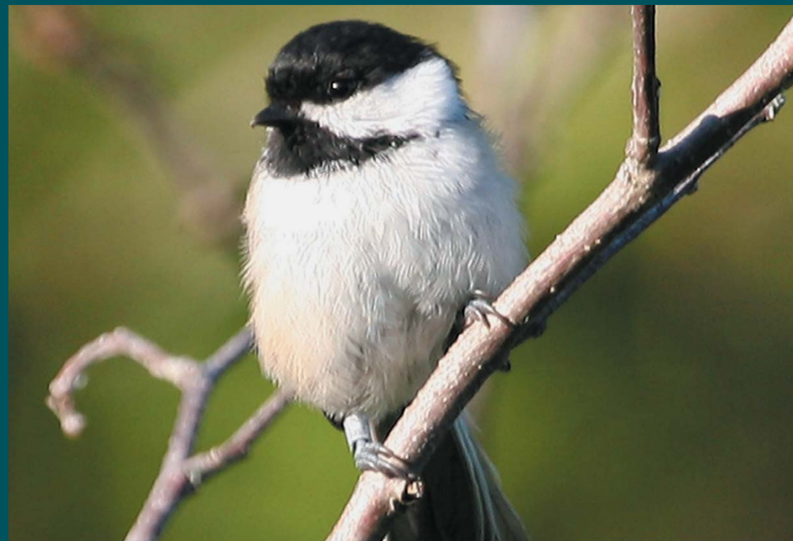
Black-capped Chickadee ( Poecile atricapilla )