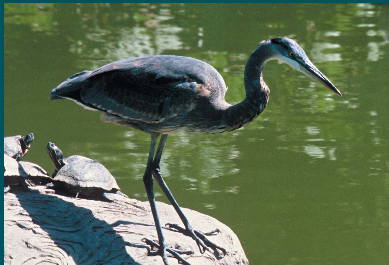
Great Blue Heron ( Ardea herodias )