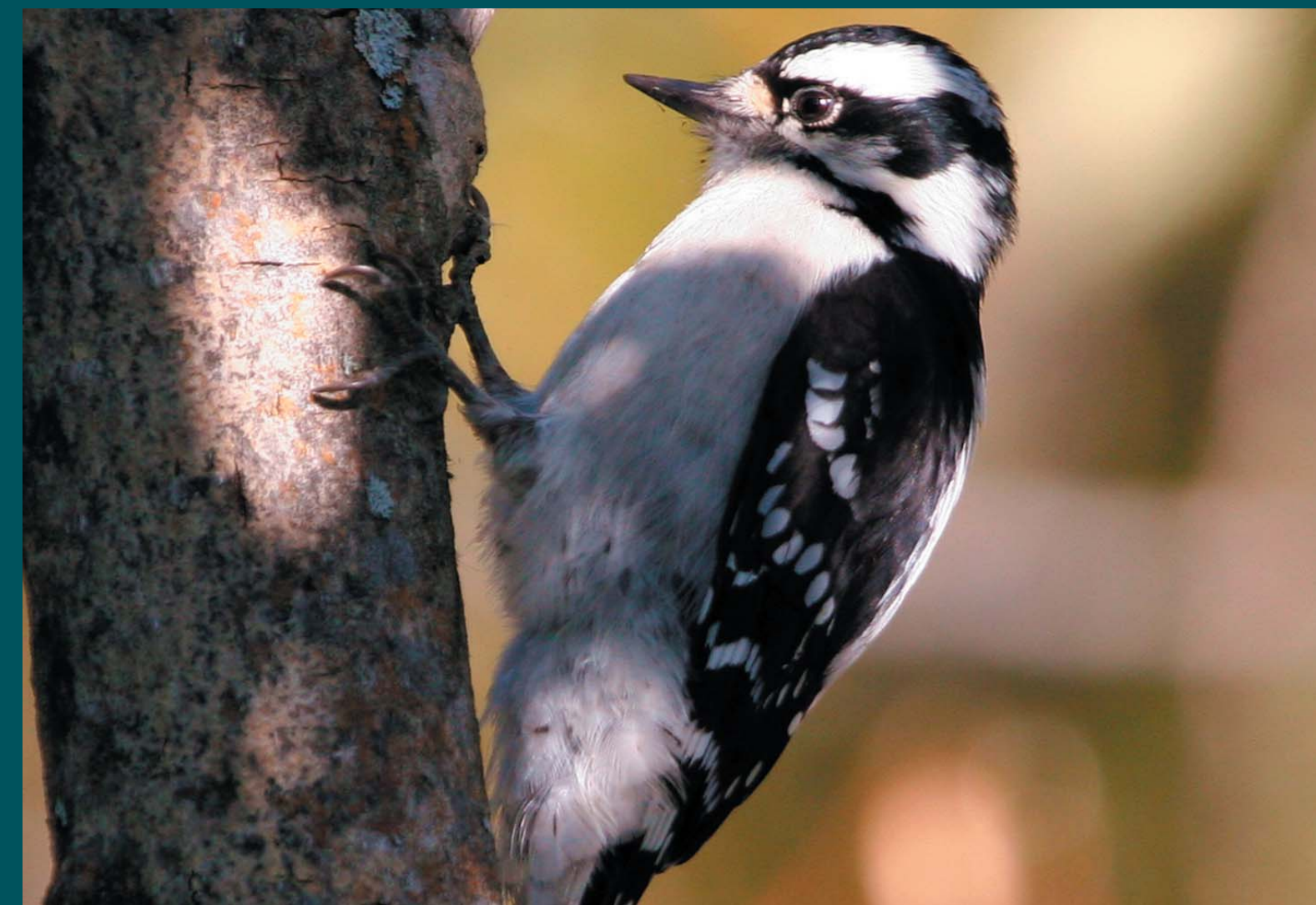
Downy Woodpecker ( Picoides pubescens )