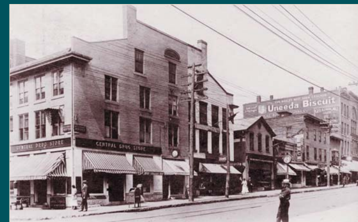
Sherman's Block, c. 1917.

The architecture along Church Street dates from the 1820s to the present. Many buildings are large, high-style, masonry Italianate or Queen Anne commercial blocks, but there are also earlier gable-front residences and modest wood frame business blocks. Buildings on Church Street have received Art Deco renovations, 20th century replacements after fire loss, and historic renovations illustrating the desire of Burlington merchants to build to the highest quality while offering the most modern of building materials and style.