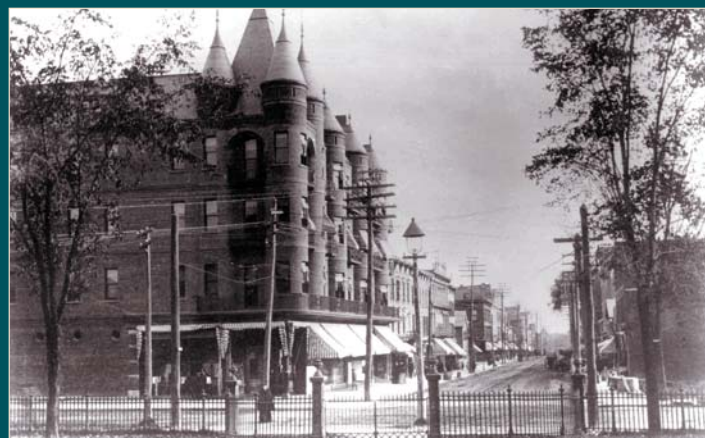
Chateausque Richardson Block, c. 1895.