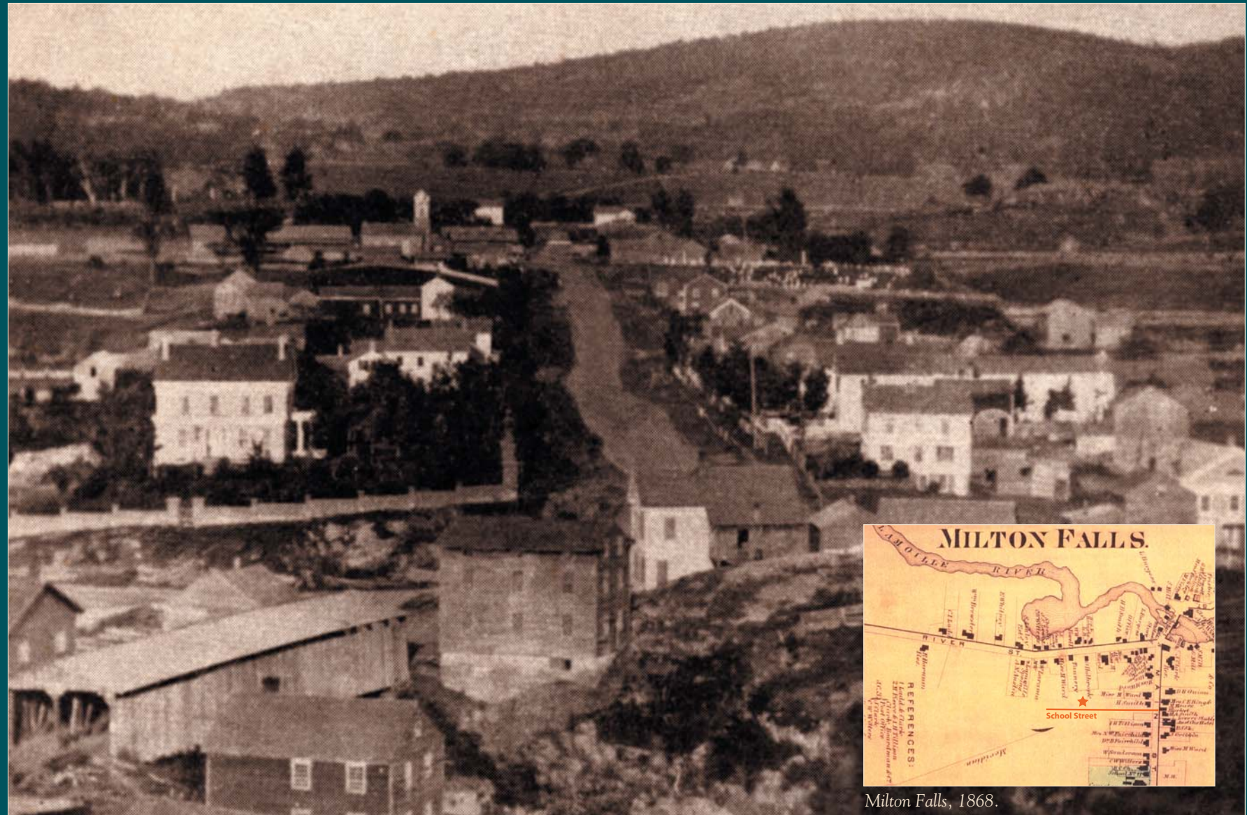
Milton Falls Village in 1840, looking east.

Do you want to learn about 200 years of Milton's past, from early lumbering and farming to the present? Visit the Milton Historical Museum, established in 2001 in the former Trinity Episcopal Church on School Street (see map). A Soldiers Monument, honoring the 200 Milton men who served during the Civil War, is located on site.