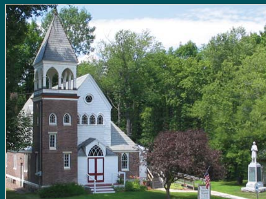
Milton Historical Museum on School Street.