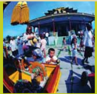
Temple festival near Lake Baikal.

"It was so great to see Lake Baikal's freshwater seals! Can you name some mammals that live in Lake Champlain? Are any endangered?"