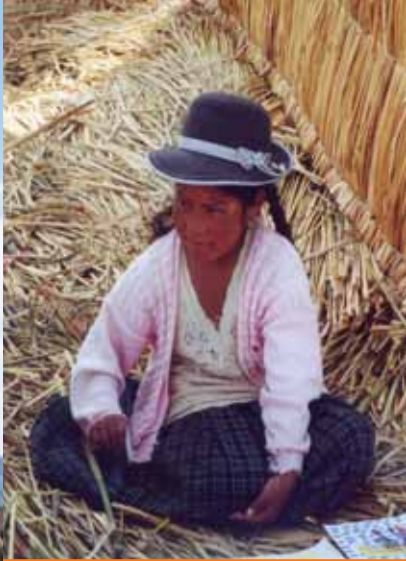
Hiking around Lake Titicaca and a Peruvian girl at the market.