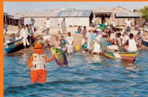
Meeting some fishermen on Lake Victoria.

AFRICA Lake Victoria KENYA TANZANIA UGANDA