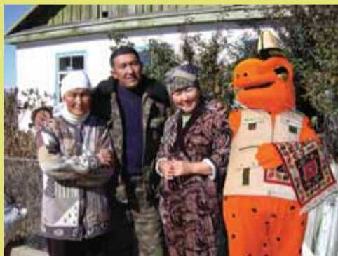
Meeting the Lake Issyk-kul game warden and his family.

"It was so great to see Lake Baikal's freshwater seals! Can you name some mammals that live in Lake Champlain? Are any endangered?"