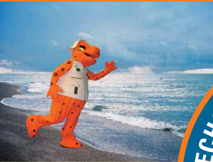
Running along the shore of Lake Issyk-kul.

"Hmm... If Lake Champlain is 120 miles long and Lake Superior is 2.9 times longer than Lake Champlain, how long is Lake Superior?"