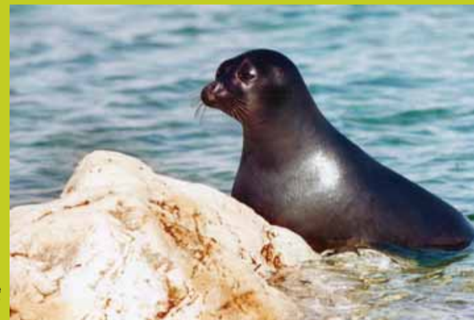
Lake Baikal's seals are called "nerpa."