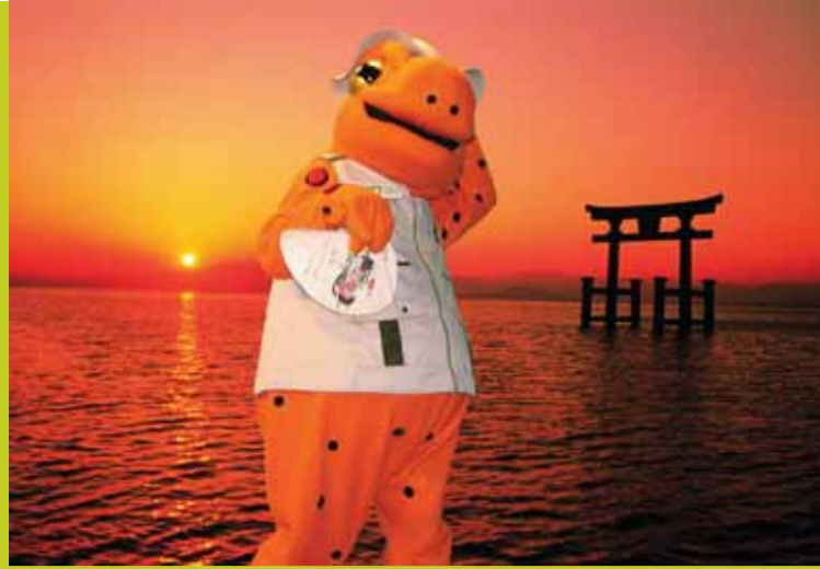
Sightseeing at Jinga Shire gate in Lake Biwa, Japan.

"Hi from Lake Biwa in Japan! Creepy... a legend says a giant carp eats people who drown in this lake! Do people tell any weird stories about Lake Champlain?"