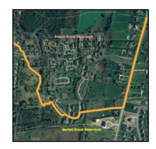
St. Albans Marsh Restoration Study, City of St. Albans, VT.

Bartlett Brook Stormwater Management Project, City of South Burlington, VT