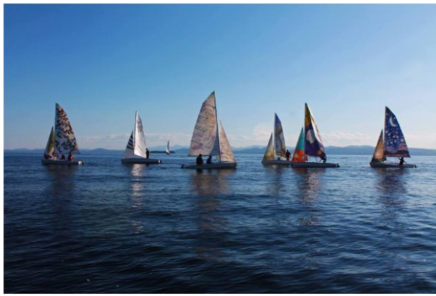
Community Sailing Center

Proposal evaluation and selection criteria: Proposals received in response to this RFP will undergo a panel review, and will be scored according to the following criteria for a total of 100 points: