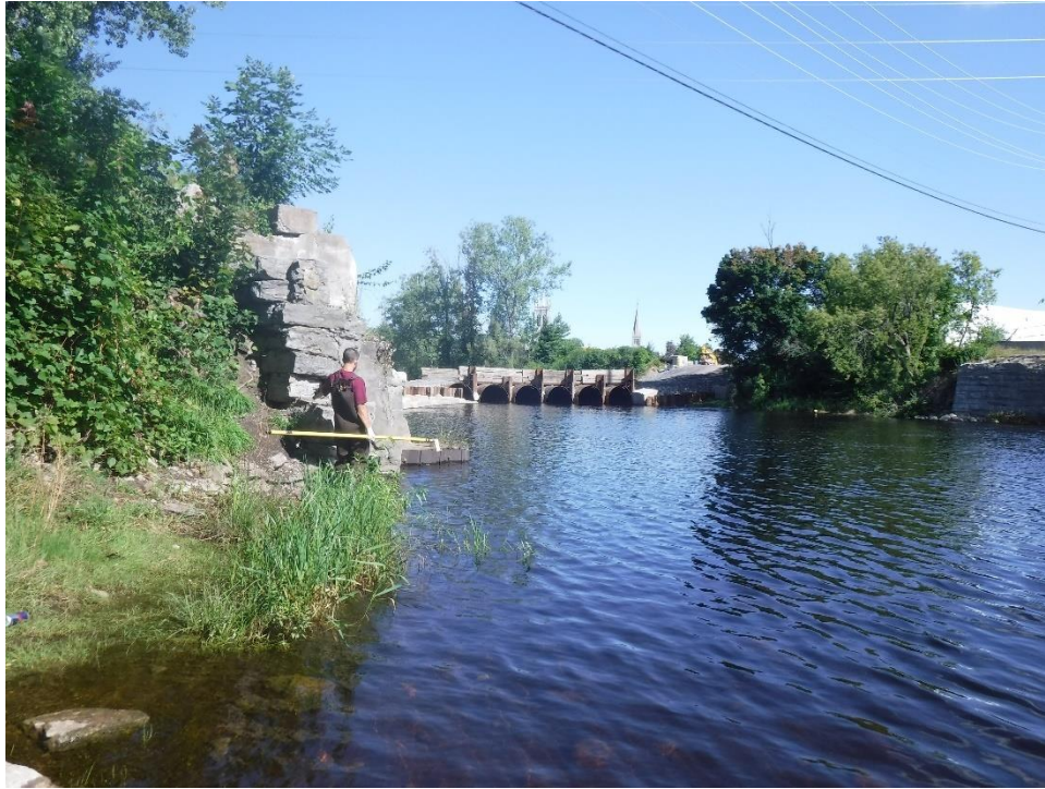
Photograph 5. Sample location RW2 - Saranac River downgradient of CSO locations #020, #007 and #019, looking downstream (dredging/remediation project).