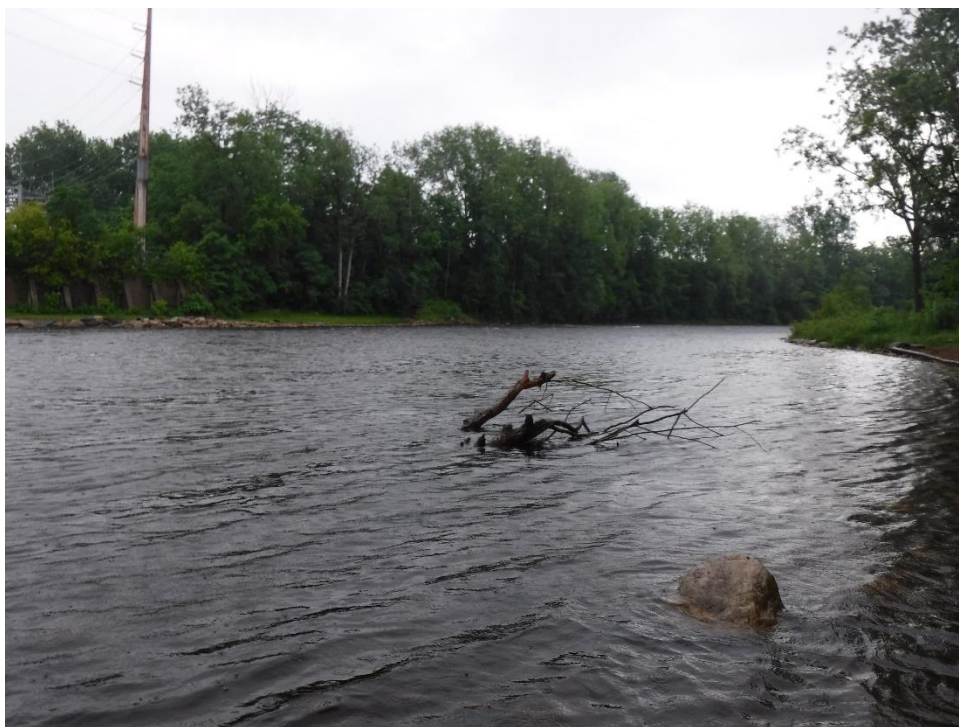
Photograph 4. Sample location RW2 - Saranac River downgradient of CSO locations #020, #007 and #019, looking upstream.