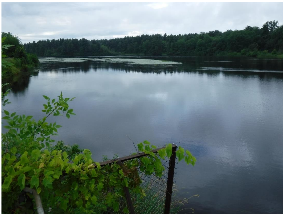
Photograph 2. Sample location RW0 – Saranac River upgradient of CSO locations, looking upstream.