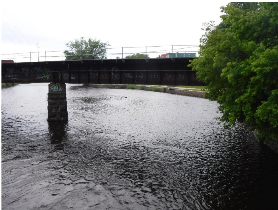
Photograph 6. Sample location RW3 – Saranac River downgradient of all CSO locations, looking upstream.