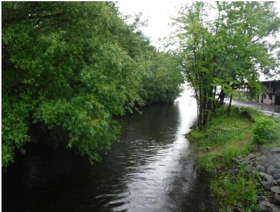
Photograph 8. Sample location RW4 – Scotion Creek, looking downgradient at the Creek's mouth at Lake Champlain.