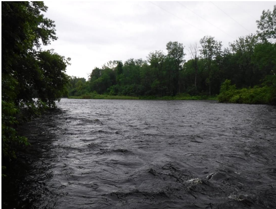
Photograph 3. Sample location RW1 – Saranac River upgradient of CSO locations, looking upstream.