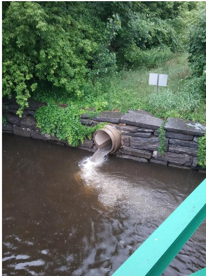
Photograph 7. Sample location RW3 – Saranac River and example of CSO #002 during discharge.