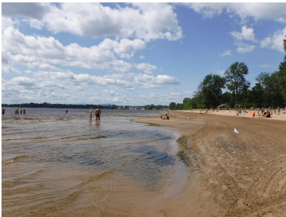
Photograph 9. Sample location RW5 – Plattsburgh municipal beach bathing area.