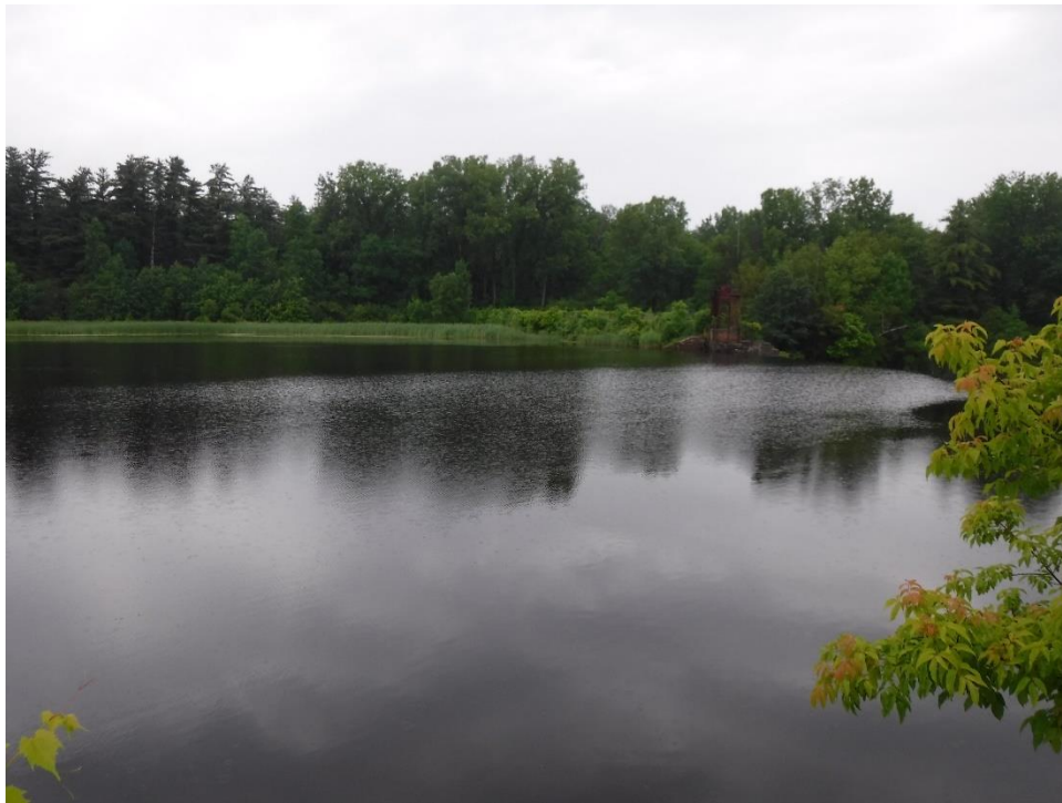
Photograph 1. Sample location RW0 – Saranac River upgradient of CSO locations, looking downstream.