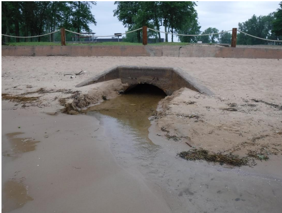
Photograph 10. Sample location RW6 – outfall (from adjacent parking lot) onto Plattsburgh municipal beach during discharge.