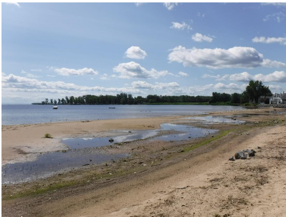
Photograph 11. Sample location RW17 – public access beach behind a McDonald's restaurant on Route 9, Plattsburgh, NY.